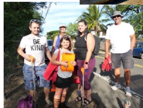
Residents & visiting family cleanup in Puako Beach