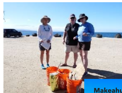
Resident & Vacationers at Kawaihae Surf Park