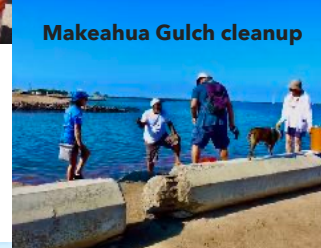
Makeahua Gulch cleanup